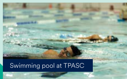
Swimming pool at TPASC