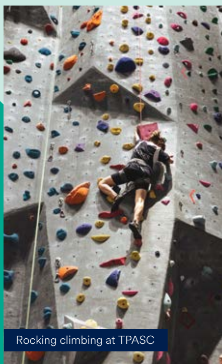
Rocking climbing at TPASC