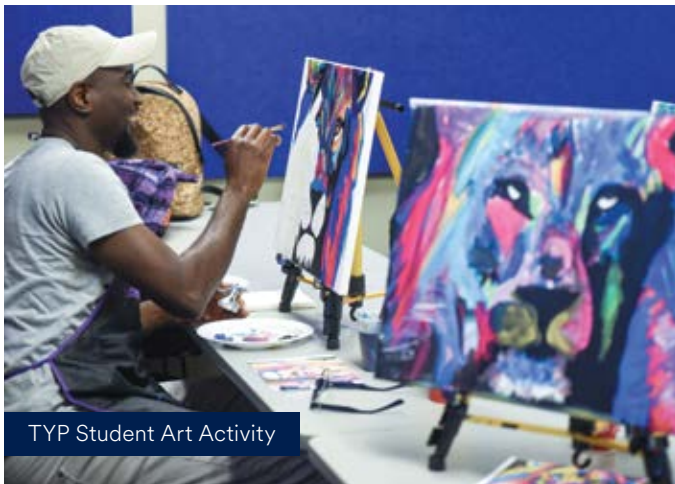
TYP Student Art Activity