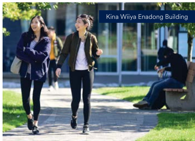
Kina Wiiya Enadong Building