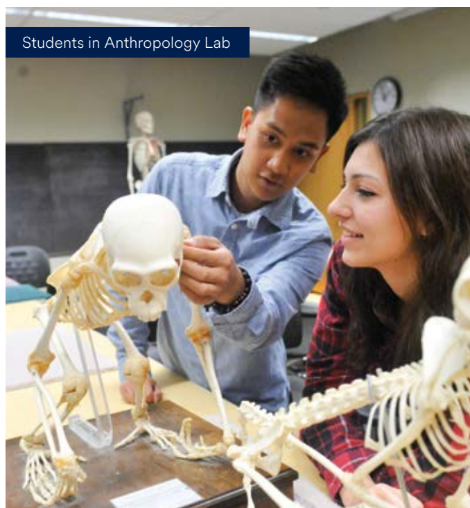
Students in Anthropology Lab