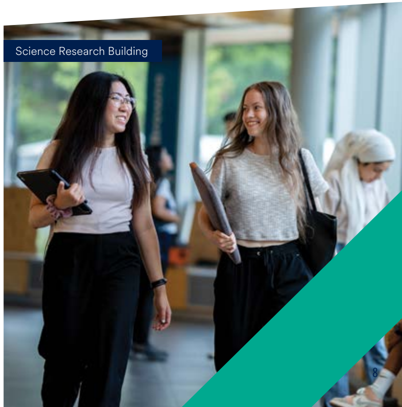
Science Research Building