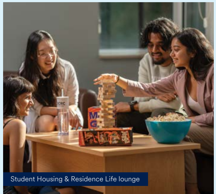
Student Housing & Residence Life lounge