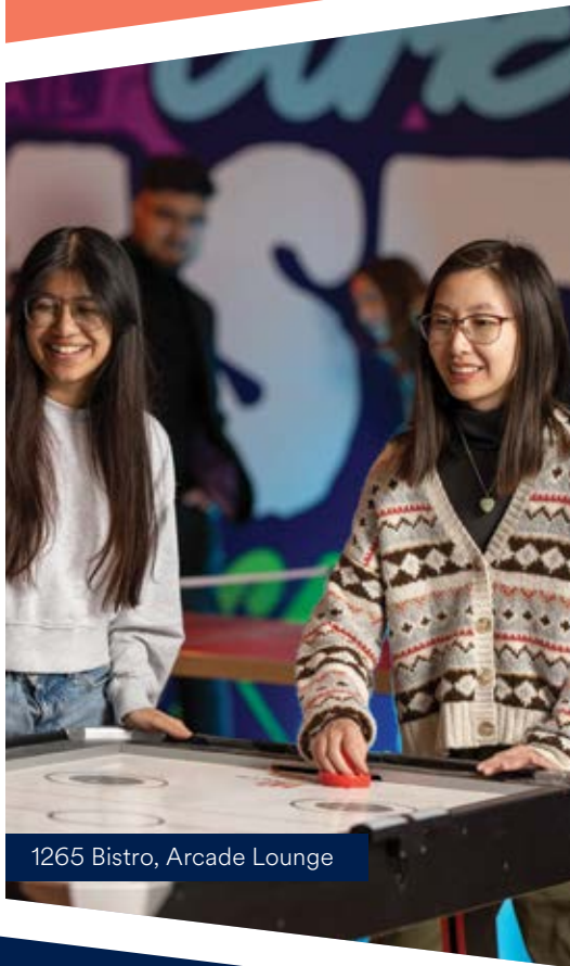
1265 Bistro, Arcade Lounge