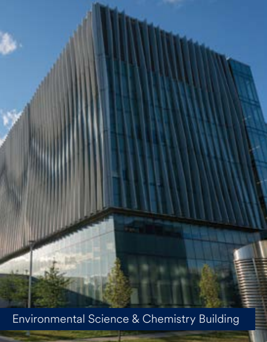
Environmental Science & Chemistry Building