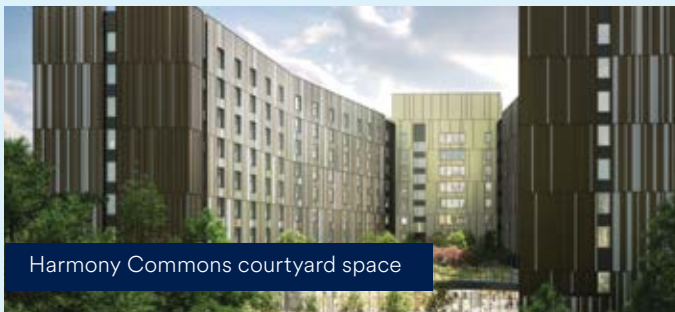
Harmony Commons courtyard space