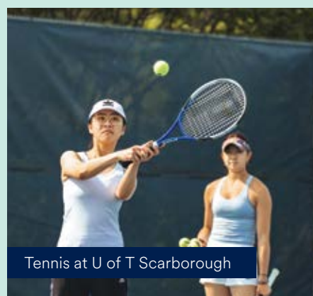
Tennis at U of T Scarborough