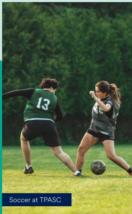
Soccer at TPASC

Your mind will be challenged inside and outside the classroom as you learn, participate in research, and hone your skills. But it's just as important to us that your overall health and well-being is supported. The Health & Wellness Centre offers a variety of services and programming, including mental health counselling, medical appointments, and health promotion initiatives. To create an inclusive and nurturing environment where you can thrive, there are also opportunities for you to join the Mental Health Network, where students, staff, librarians, and faculty work together to support mental health on campus; the Wellness Peer Program, which increases awareness about healthy lifestyle choices; and the Peer Supporters, who offer personalized and group mental health support.