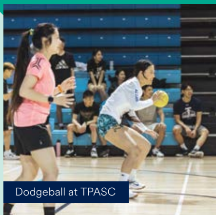
Dodgeball at TPASC