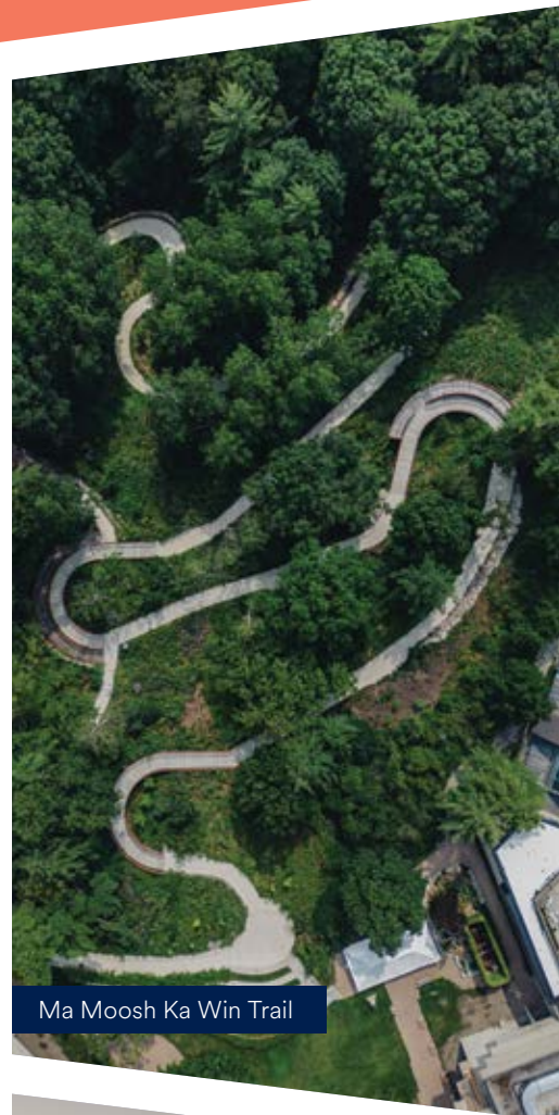
Ma Moosh Ka Win Trail