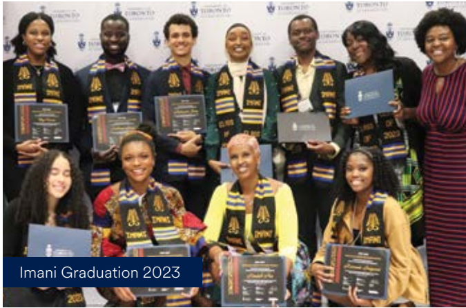
Imani Graduation 2023

U of T Scarborough stands out not only for its exceptional academics but also for fostering a warm campus environment centred around Inspiring Inclusive Excellence. Our campus actively embraces and encourages the valuable contributions that stem from the diverse backgrounds, knowledge systems, ideas, viewpoints, and experiences present within our tight-knit community.